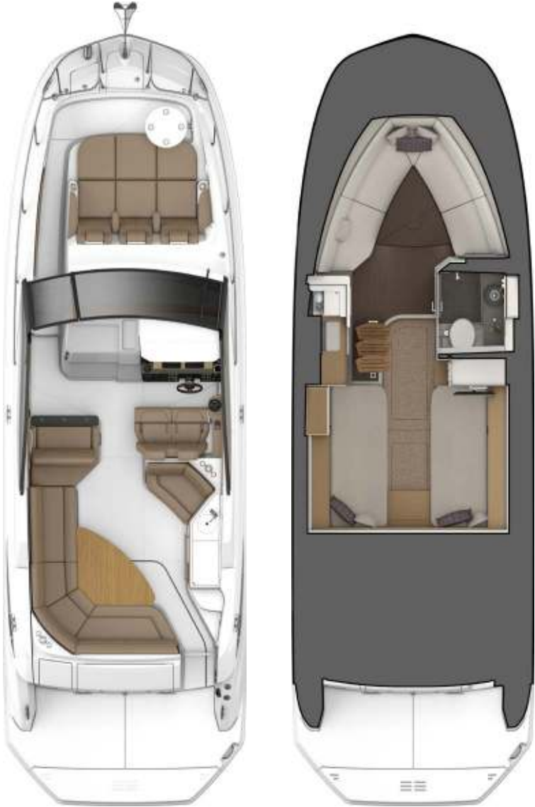
DECK / COCKPIT Shown with optional equipment