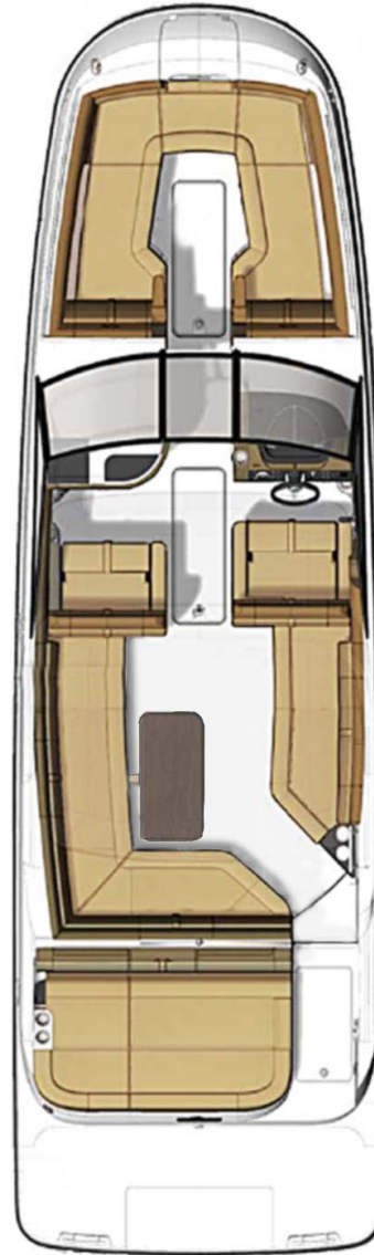
STANDARD SEATING PLAN